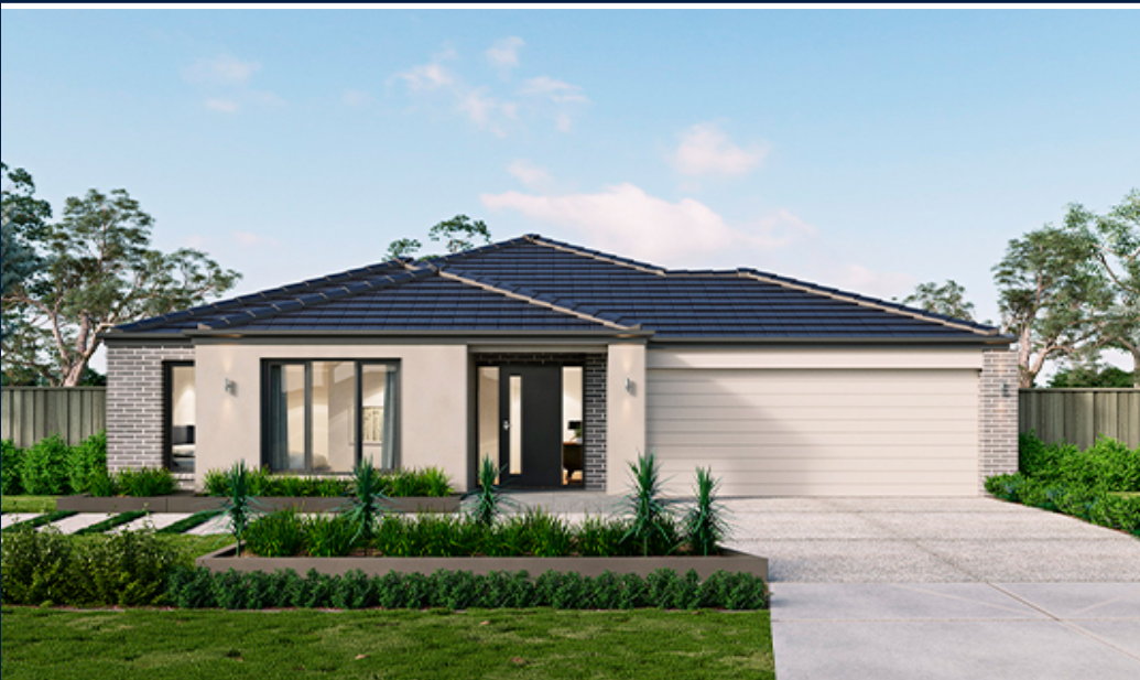
Price excludes upgrade items above standard specification such as feature render and bricks, front entrance timber decking, front entry door, brick infills above garage, external lighting, fencing, concrete paths and driveway. Façade Image may also contain items not supplied by Metricon Homes, namely landscaping and planter boxes.