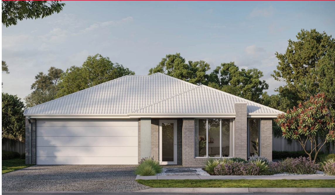
RIVERSTONE 23 | ELEVATE RANGE