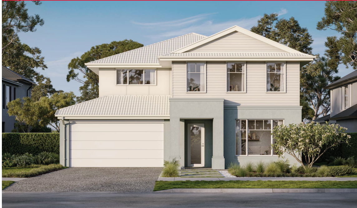
ARMIDALE 34 | ELEVATE RANGE