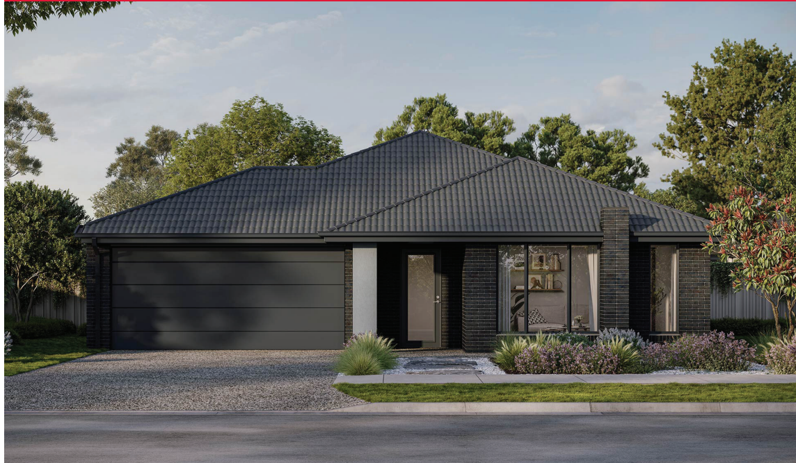
KALBARRI 25 | ELEVATE RANGE