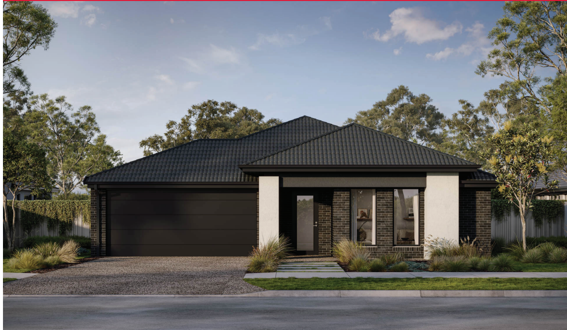
GARNET 25 | ELEVATE RANGE