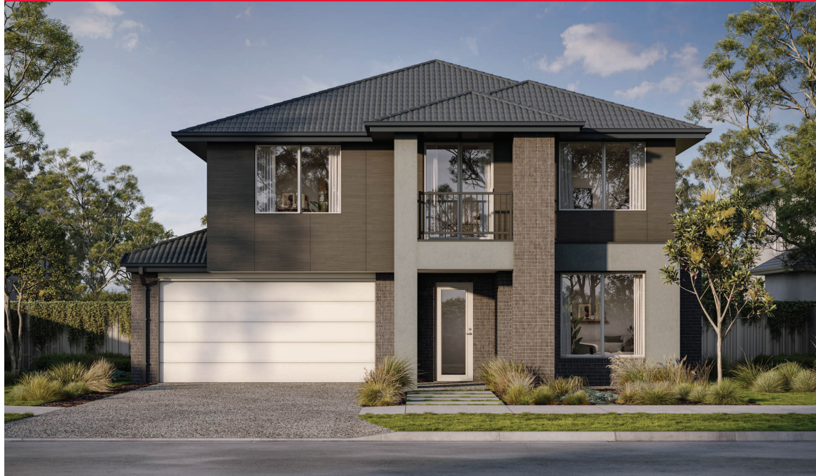
IRONBARK 37 | ELEVATE RANGE